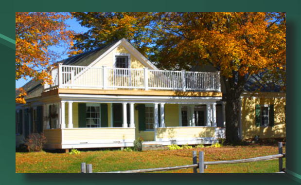
The Inn at Teela-Wooket